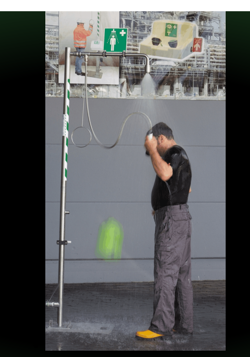
1211001 Körpernotdusche Sonderkonstruktion